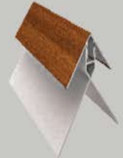
Corner Trim (Inside & Outside)

12' Aluminum | 2-Piece System (Base & Top) For transitions | Exposure Width: 2 1/2"